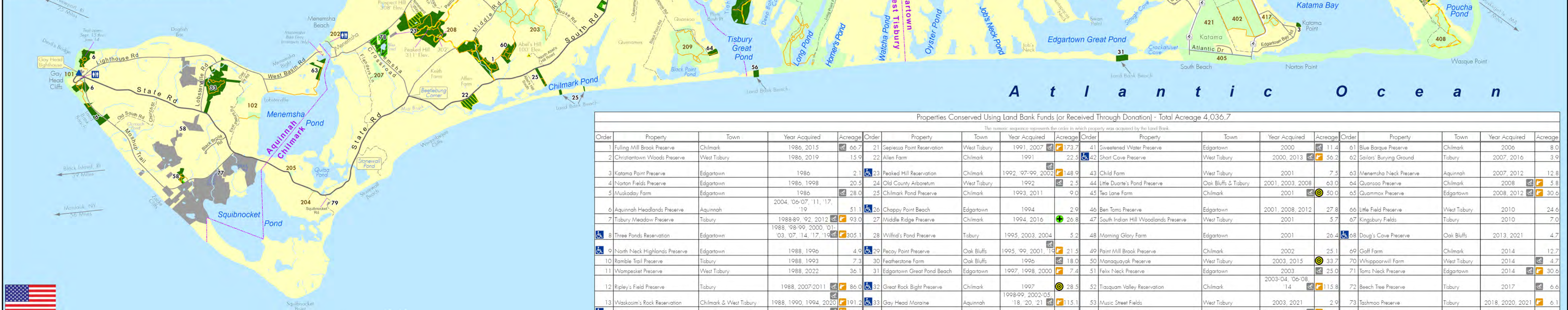
Properties Conserved Using Land Bank Funds (or Received Through Donation) - Total Acreage 4,036.7